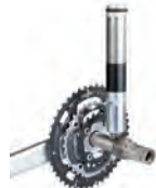
VIVAX ASSIST 4.0