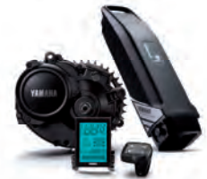
PW DRIVE UNIT