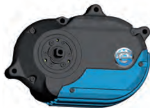
MPF DRIVE MOTOR