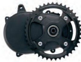
36 V MOTOR