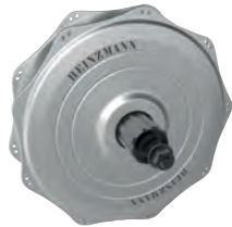
DIRECT POWER PRA 180-25